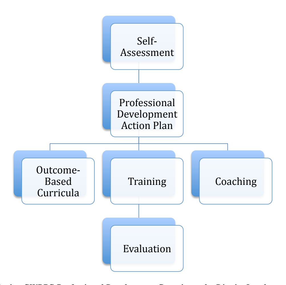
Developing SWPBS Professional Development Capacity at the District Level

To further assist district leadership teams with the development of a comprehensive professional development plan, a series of guiding questions, tools and supports, activities, and desired outcomes are provided in the figure below. The list of guiding questions is organized by phase of implementation and should be explored relative to the continuum focus indicated (universal, tier II, tier III) in the district's self-assessment.